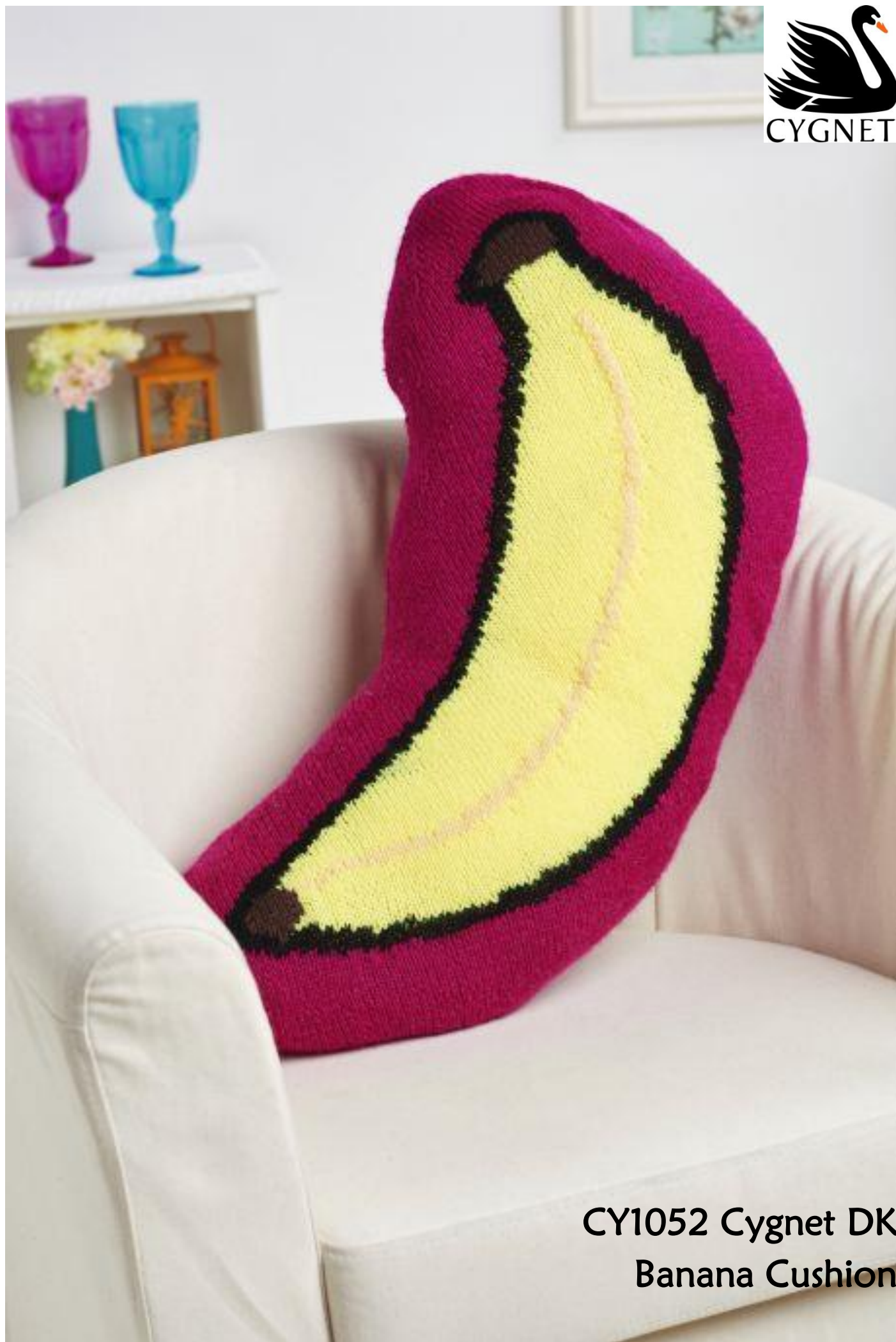
CY1052 Cygnet DK Banana Cushion